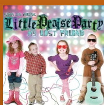
Little Praise Party My Best Friend